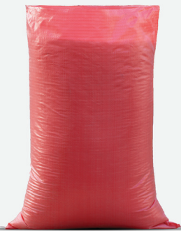
PP WOVEN BAGS