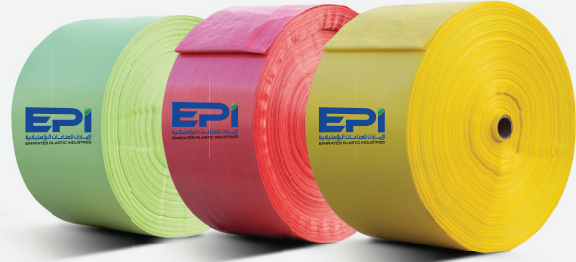
PP WOVEN ROLLS (CUSTOMIZED)