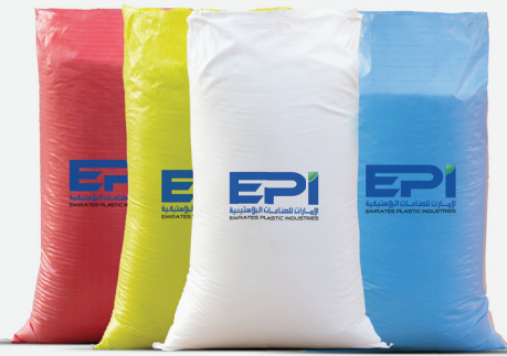
PP WOVEN BAGS (CUSTOMIZED)