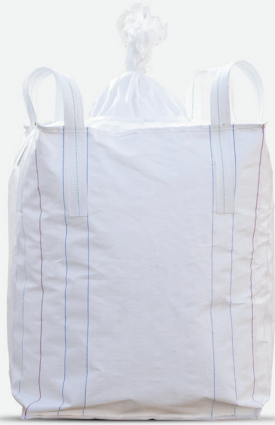
PP JUMBO BAGS