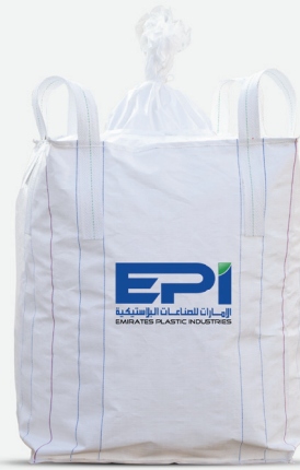
PP JUMBO BAGS (CUSTOMIZED)