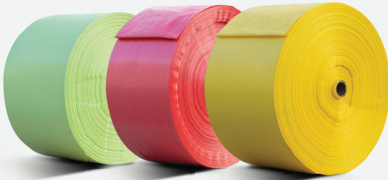
PP WOVEN ROLLS